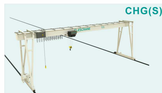
CHG(S) Series Single Girder Gantry Crane Max. Load: 20t