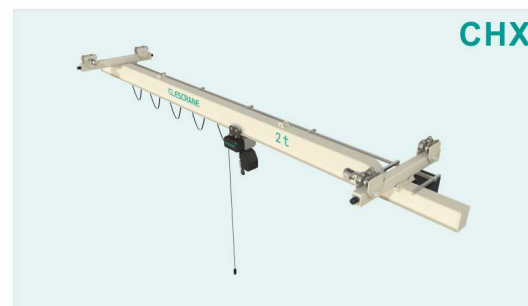
CHX Series Single Girder Suspension Crane Max. Load: 10t