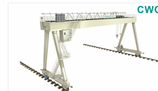
CWG Series Double Girder Gantry Crane Max. Load: 320t