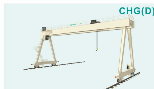
CHG(D) Series Double Girder Overhead Crane Max. Load: 100t