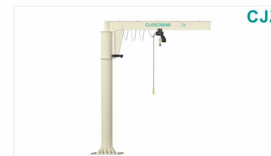
CJZ Series Pillar Mounted Jib Crane Max. Load: 10t