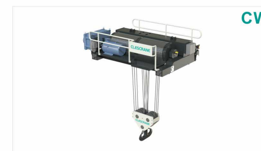
CW Series Open Winch Trolley Max. Load: 320t