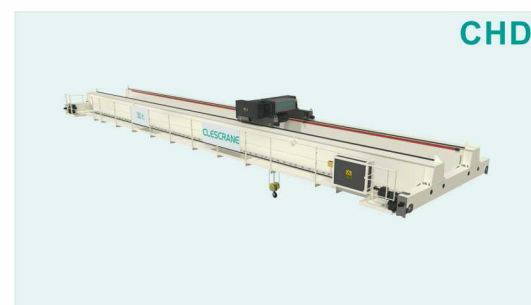
CHD Series Double Girder Overhead Crane Max. Load: 100t