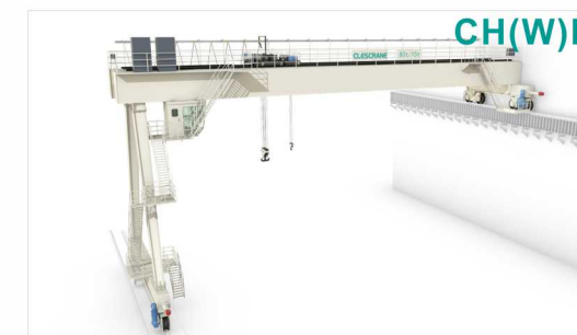
CH(W)B Series Semi Gantry Crane Max. Load: 100t