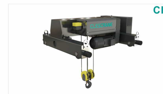
CH Series Wire Rope Electric Hoist (for Double Girder Crane) Max. Load: 100t