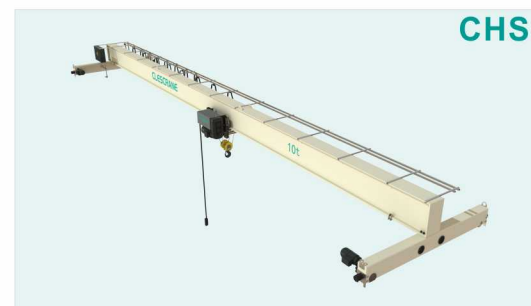
CHS Series Single Girder Overhead Crane Max. Load: 20t