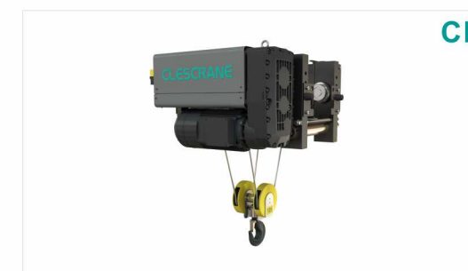
CH Series Wire Rope Electric Hoist (for Single Girder Crane) Max. Load: 20t